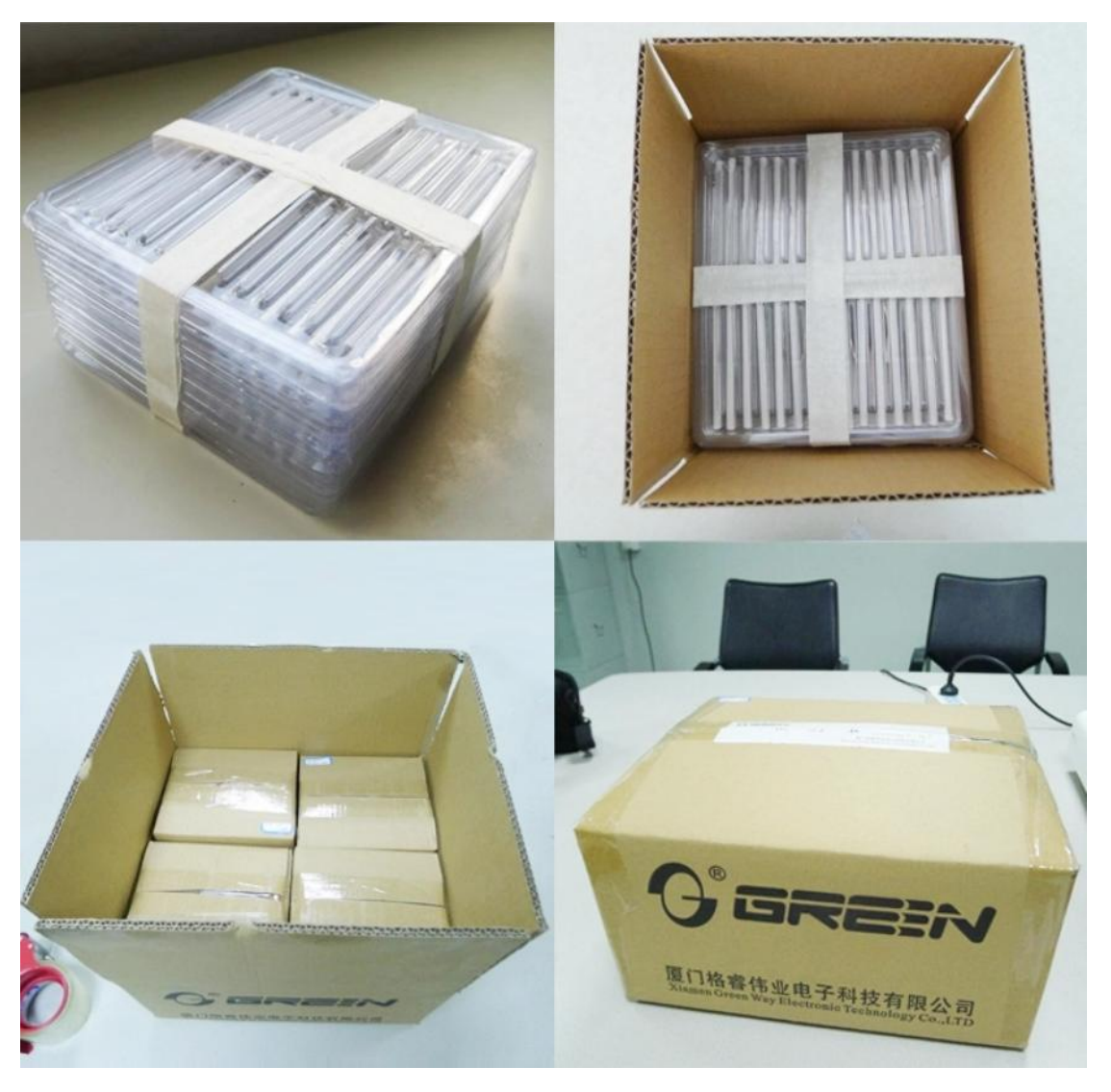
Fast International Express Delivery such as DHL,TNT,FEDEX, UPS ect.